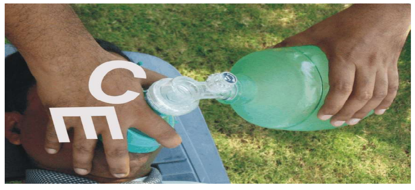
Fig 2 C-E Grip for Resuscitation Bag

However, in cases of neurotoxic envenomation, if respiratory failure occurs it will be due to flaccid