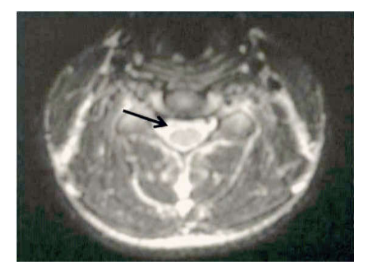
Fig. 2: Neutral Asymmetric flattening of cord

Suspicious cord thinning, obliteration of posterior epidural space