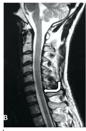
Fig. 1: Neutral

changes(Figure 1). Asymmetric flattening of spinal cord with reduced posterior subarachnoid space was also seen(Figure 2). On imaging with neck flexion anteriorly shifted posterior dura was seen with congested posterior epidural venous plexus (Figure 3).On contrast application intense homogenous enhancement of venous plexus was seen(Figure 4).