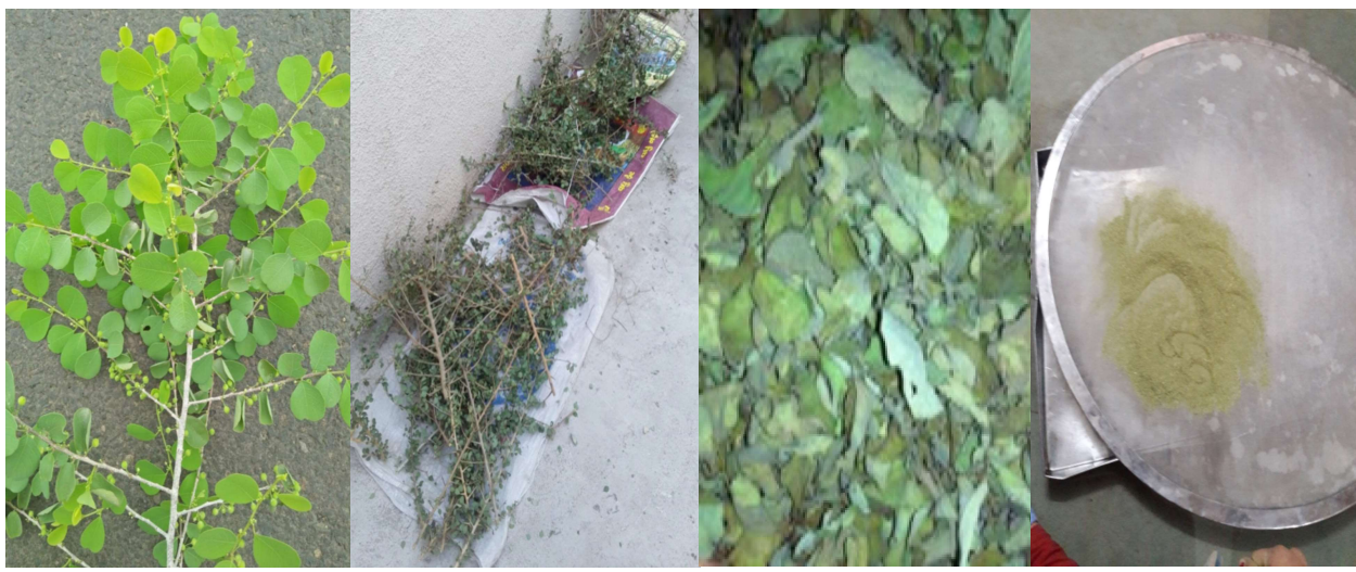
Collected Katupila plant