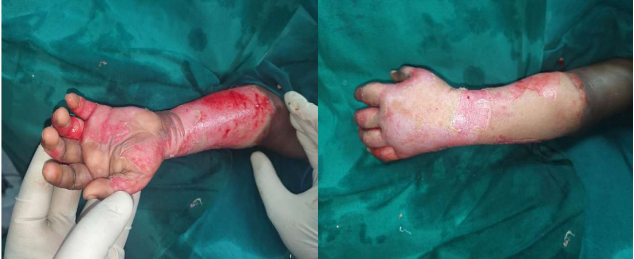
Fig. 1: Second-degree burns at the time of admission