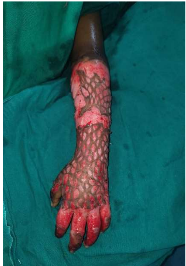
Fig. 3: Split skin grafting