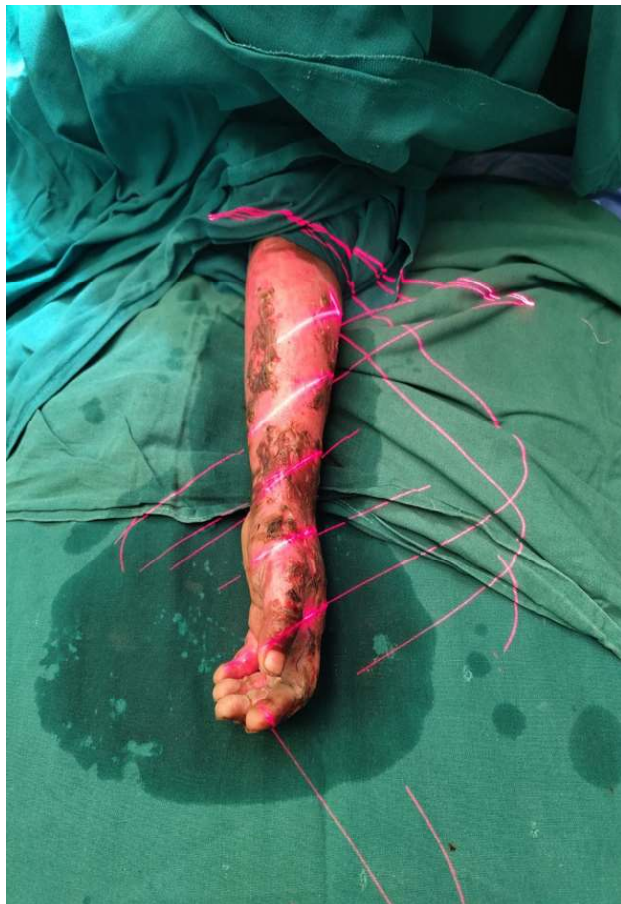
Fig. 2: Low level laser therapy after serial debridement