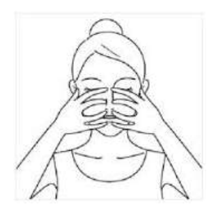
Fig. 4: Brahmari pranayama.