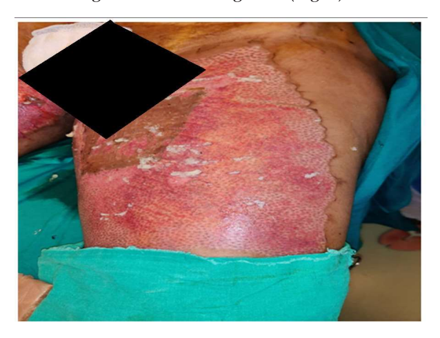
Fig. 5: Superificial degree healed and deep treated with SSG.

Skin graft was done. Additionally, it has been noted that NPWT, when used as a support, can aid in promoting graft take and may lower the chance of needing additional skin grafts. (Fig. 5)