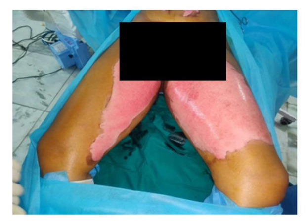
Fig. 2: After Tangential Exision

According to the TIME concept described in therecommendations, the wound bed was prepared, and the ulcer was serially examined and document the Bates-Jensen wound evaluation method (Fig. 2).