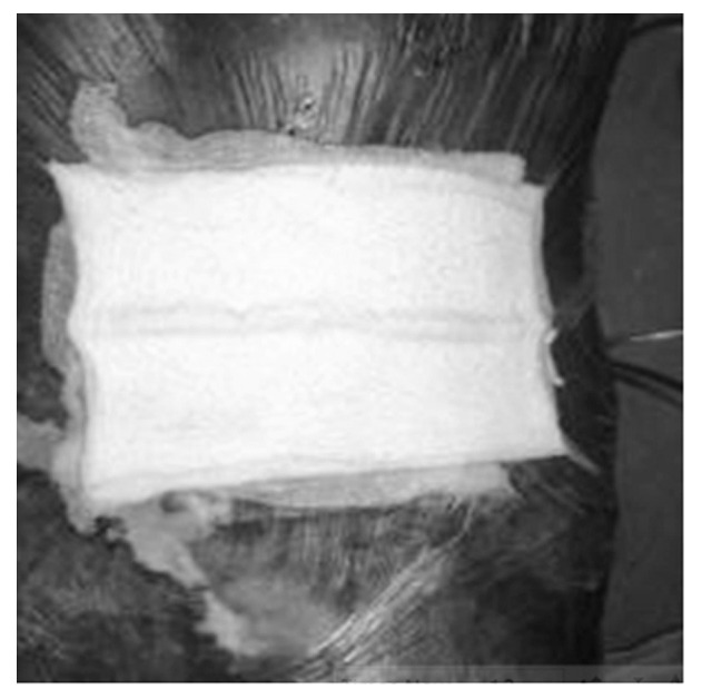
Fig. 4: Negative pressure wound therapy

Gastroenterology International / Volume 7 Number 1 / January - June 2022