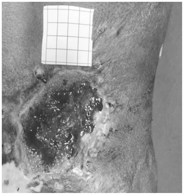
Fig. 5: Raw area at the end of 3 sittings of biosilk application