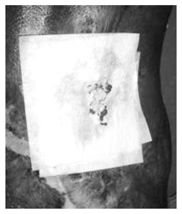
Fig. 3: Collagen sheet application over raw area

On post operative day 30, biosilk in cream form was applied (Figure 2) whose constituents include silk, Centella asiatica, silver oxide. Following application of biosilk, dry collagen sheets were applied (Figure 3) and the wound was then covered using negative pressure wound therapy technique (Figure 4). This dressing was done similarly for 3 sittings over a span of 2 weeks following which wound dimensions were measured and was found to be as shown in figure 5.