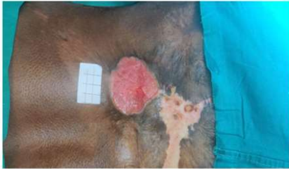
Fig. 1: Raw area of back

was performed, which ruled out regional and distant metastasis. After the defect was closed, radiotherapy was recommended to the spot. Because the surrounding tissue was unhealthy, the first stage operation was a delayed staged type 3 keystone flap. (Fig. 3, 4) Based on vascularity and clinical judgement, the remaining delayed staged keystone flap or transposition flap will be performed on the opposite side in the second stage (Fig. 5). After the keystone flap, we planned for a transposition flap to cover the defect (Fig. 6, 7).