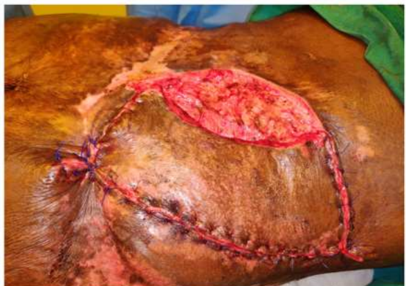
Fig. 5: Defect of opposite site