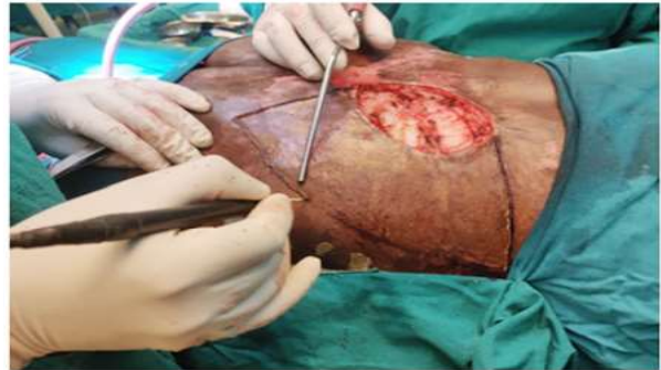
Fig. 2: Raising of the flap in delayed staged keystone flap