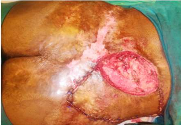
Fig. 3: Delaying of the keystone flap by re-suturing