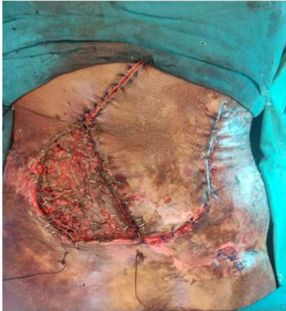
Fig. 7: Transposition flap with SSG