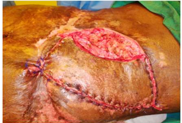
Fig. 4: Inset of the delayed staged keystone flap