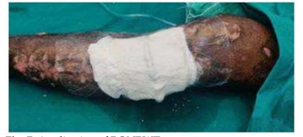
Fig. 7: Application of RONPWT

surgery was deferred and conventional flap was planned. After admission, investigations were done to identify the cause of the non-healing of the wound. Osteomyelitis was suspected to be the primary cause and the patient underwent a Technetium 99m-methyl diphosphonate (Tc 99m MDP) triple phase bone scan which revealed the possibility of active osteomyelitis. To confirm further, he underwent a WBC scan (Fig. 2 and 3), which found no evidence of active osteomyelitis of the proximal tibia or the knee joint. Following this he underwent hydro jet debridement with regenerative therapies like Low Level Laser Therapy (LLLT)(Fig. 4), Autologous Platelet Rich Plasma (APRP) infusion (Fig. 5), cultured epidermal grafting and dermal grafting, collagen scaffold application (Fig. 6) and Regulated Oxygen Negative Pressure Wound Therapy (RONPWT)(Fig. 7) for wound bed preparation. He then underwent local perforatorkeystone flap (Type 2B)(Fig. 8) with a split thickness skin graft over the raw area (Fig. 9). The debrided bone during surgery which was sent for histopathology reported as chronic osteomyelitic changes and hence, intravenous (IV) antibiotics were givenaccording to tissue culture and sensitivity.