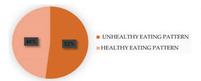
Fig. 2: Pie diagram showing the frequency distribution of the study subjects by their eating pattern