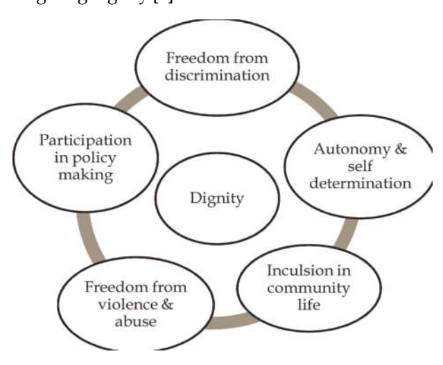
Fig. 1: Dignity required areas

Dignity refers to an individual's inherent value and worth and is strongly linked to respect, recognition, self-worth and the possibility to make choices. Being able to live a life with dignity stems from the respect of basic human rights including the following aspects of giving dignity [2]: