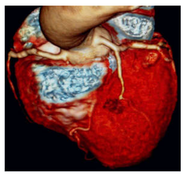
Fig. 3: Dual LAD (short and long) and long LAD arising from RCA in 256 slice CT coronary angiogram

We thought to delineate the cause of effort dyspnea in aforesaid patient and proceeded for 256 slice coronary CT angiogram under tailored heart rate modulation and gained the 3D CT reconstruction route of Dual LAD which revealed that long LAD which was originating from RCA was traversing being sandwiched between pulmonary artery and aorta in proximal part just after origin; whose compression in exertion may be the explanation of effort dyspnea in this patient. We treated the patient with antiplatelet, highest dose statin, beta blocker and nitrate with clearance for surgery under moderate perioperative CV risk with restriction of