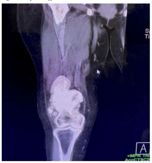
Fig. 8. Pre Op X-ray Distal end Femur