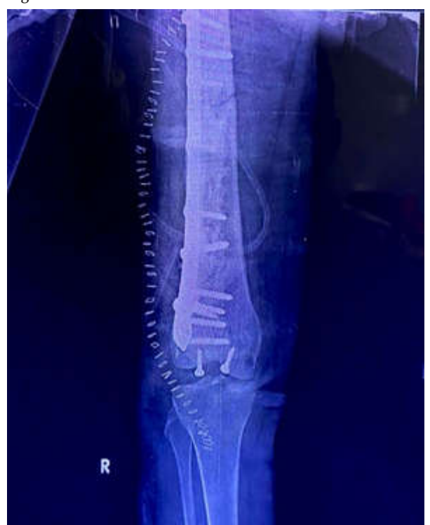
Fig. 2. Post Fixation X-Ray