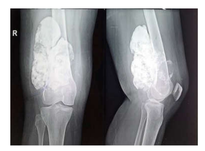
Fig. 6. Pre op CT scan