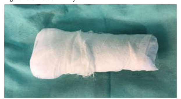
Fig. 3. Layered Wrapping of Bone Segment for Radiation