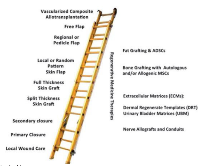
Fig. 5: Hybrid Reconstructive Ladder.

result in significant donor site morbidity. Revised amputations may have non-pliable and/or nondurable surface areas prone to erosive wear with prosthetic use. Furthermore, the multiple limb injuries and amputations seen in combat casualties typically involve expanded zones of injury that extend beyond the directly affected extremities that can complicate reconstructive efforts. Furthermore, in the multiple extremity injured service member, the common accepted donor sites for autologous tissues become increasingly limited.