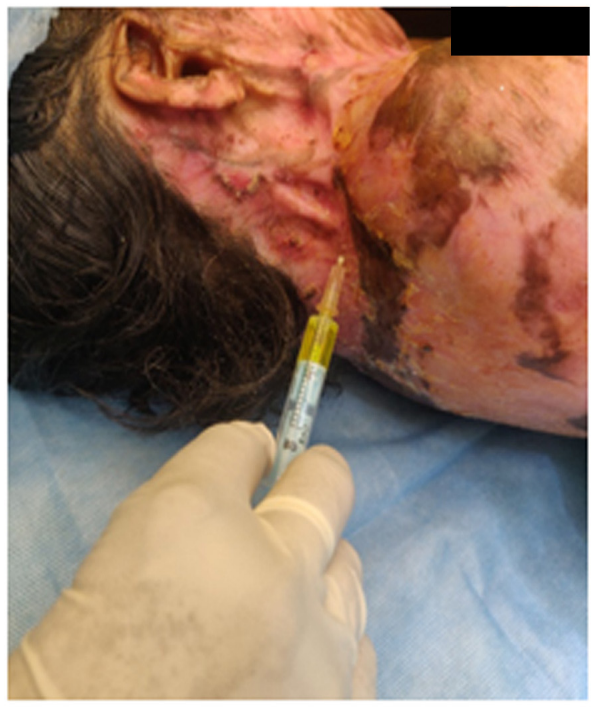
Fig. 2: Autologous platelet rich plasma

laser therapy (Fig. 3), post burn contracture release and skin grafting (Fig. 4).