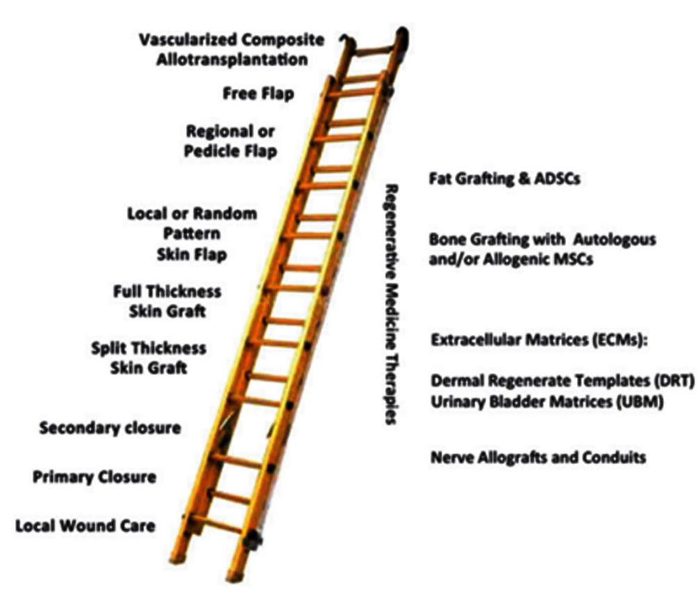
Source @ Article Plastic Surgery Challenges in War Wounded II: Regenerative Medicine

Consequently, this has led to increased use of regenerative medicine modalities to enhance tissue regeneration and improve reconstructive outcomes. Hence the term "Hybrid Reconstruction Ladder". (Fig. 5)