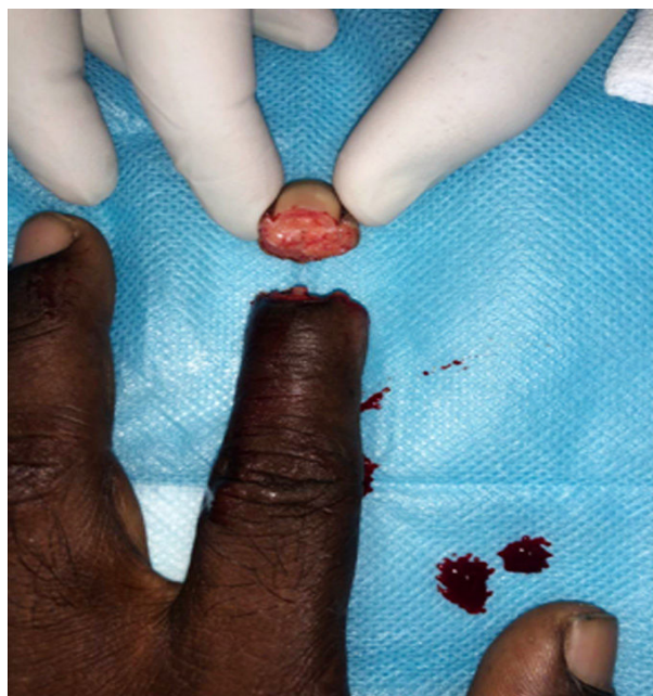
Fig. 1: Zone 1 amputations.

injuries and amputations occur. Carpal tunnel injuries are classified as Zone 4 ailments (Fig. 3). Amputations in Zone 5 and flexor tendon injuries occur close to the carpal tunnel. Only the flexor digitorum profundus tendon is removed in Zone I amputations, leaving the proximal interphalangeal joint mobility intact (PIP). Amputations at this level usually result in a positive outcome. The tiny diameter of the digital arteries may prevent