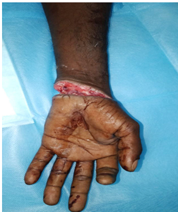
Fig. 3: Zone 4 Near total amputation.

replantation if the amputation occurs at the distal aspect of the middle phalanx or past the distal interphalangeal joint (DIP). Amputations at this level have historically had a bad prognosis due to the repair's inability to pass through the intricate digital pulley system. Amputations in Zone 2 are not absolute contraindications to replantation and should be considered in carefully selected individuals. 2