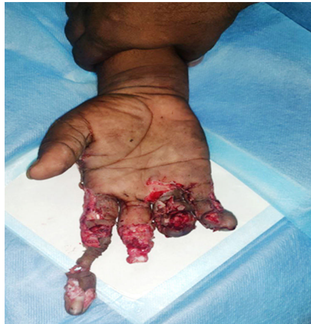
Fig. 4: Crush injury of the hand causing multiple amputations.

manageable at the facility of initial presentation.