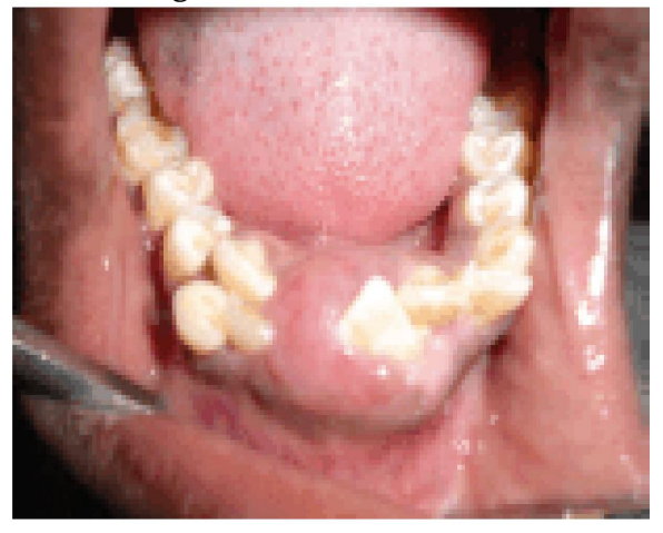
Figure 1: Intra oral view

maxillary sinus. We present a case of AOT associated with dentigerous cyst in the maxillary canine region.