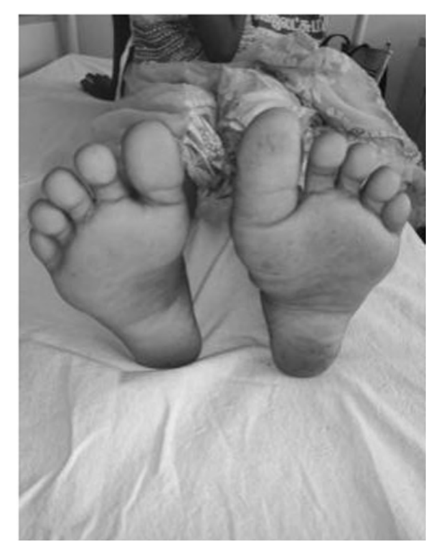
Fig. 2: At the time of presentation - plantar view

pulsatile, non compressible. Skin over the swelling shows no sign of inflammation. (figure 1) Skin over the swelling was pinchable. (figure 2) The range of movements of knee, ankle, toe movements at MTP, PIP, DIP joints were normal. The distal sensation, peripheral pulsations, capillary refill time were normal. The opposite side lower limb was normal. The upper limbs were normal. The gait was normal. The other systemic examinations were within normal limit.