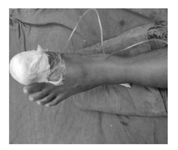
Fig. 12: Compression therapy with negative pressure wound therapy % \left( {{{\mathbf{F}}_{{\mathbf{F}}}}_{{\mathbf{F}}}} \right)

The Loub Job is a new cosmetic treatment which has become a popular and effective way to ease the discomfort of wearing high heels. Named after famous shoe designer, Christian Louboutin, dermal fillers are injected in the balls of the feet which creates an immediate gel-like cushion that soothes the usual ache you feel after too many