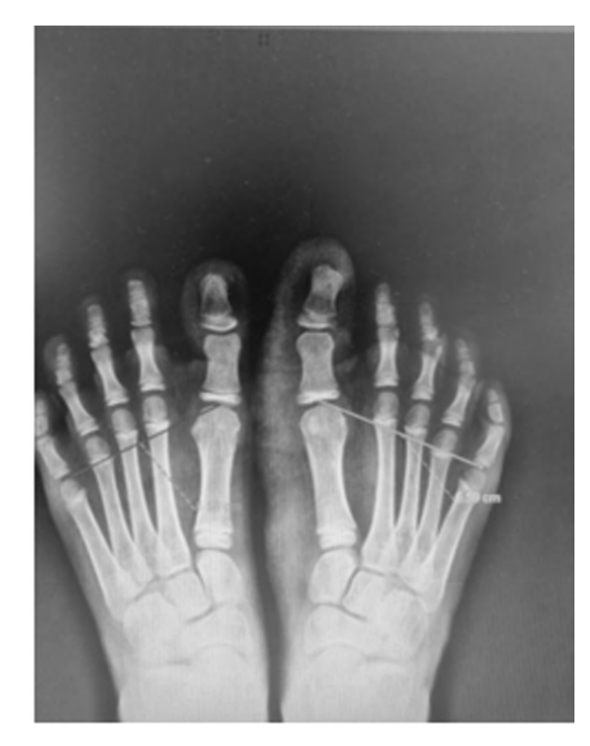
Fig. 6: Inter-metatarsal Width Ratio - 1.001