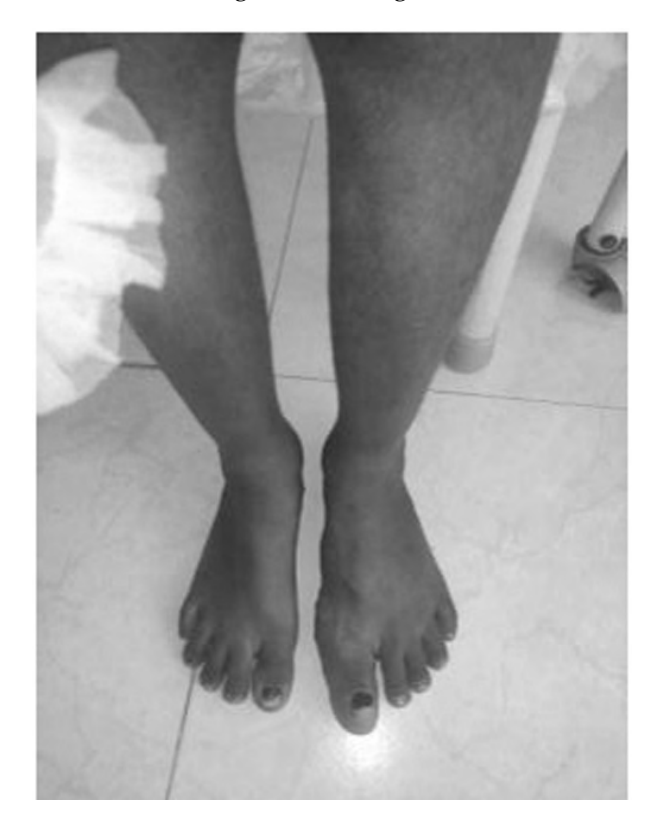
Fig. 1: At the time of presentation - dosal view

On local examination of the left leg and foot showed a swelling of the left big toe which was non