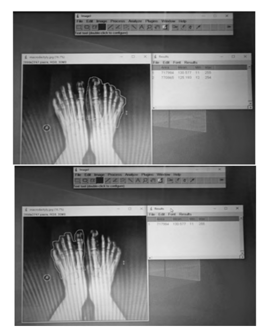
Fig. 7: Forefoot Area Ratio - 1.073

With this extensive and systematicevaluation,