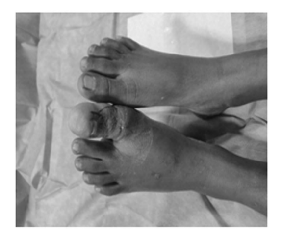
Fig. 13: Wound on 6th post operative day with no skin necrosis