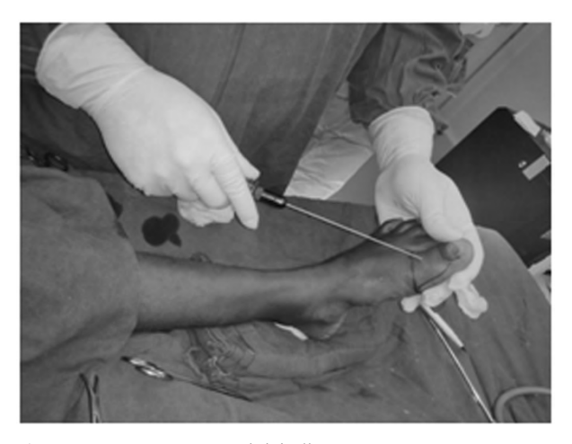
Fig. 11: Liposuction assisted debulking

The foot is less commonly affected by macrodactyly than the hand. The cause of macrodactyly has yet to be discovered. It's a type of overgrowth caused by a gain of function mutation in the PIK3CA pathway.