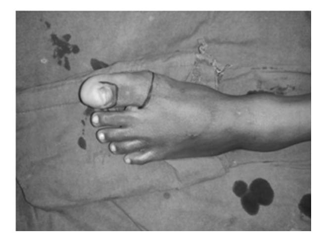
Fig. 10: Preoperative marking of crease line

measured immediately after the procedure and noted, which 7 cm. The compression dressing with negative pressure wound therapy given. (figure 12) The wound site assessment was done on the 4<sup>th</sup> post operative day.