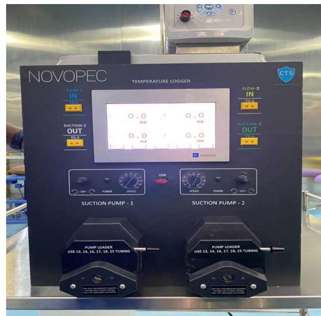
Fig. 2: Shows the HIPEC machine

After a thorough pre-operative evaluation was done bedside and formal pulmonary function tests, formal 2D-ECHO, routine investigations were done and were within normal limits, a written and informed consent was taken and the patient was posted for CRS+HIPEC. (Figure 2)