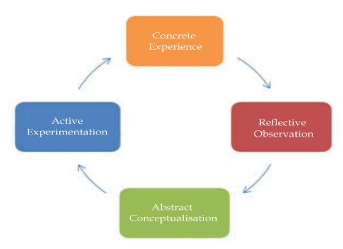
Fig. 3: The Kolb Reflective Cycle.

The Kolb Reflective Cycle Model of reflection consists of points like making a judgement, testing things out, asking how/why etc. It is acceptable for beginners but is believed to be a superficial reflective practice. The Kolb Reflective Cycle (1984) is shown in fig. 3.<sup>7</sup>