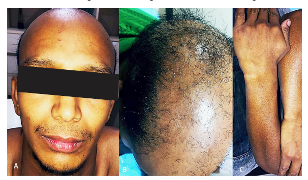
Fig. 3: Clinical features of the 22-year-old brother of the proband showing: (A) sparse scalp, facial hairs with irregular eyelashes, (B) perifollicular scaling and woolly hairs on background of cicatricial alopecia, and (C) ichthyosis on forearms

The index patient's another 18-year-old brother had a similar history of absence of hair at birth with spontaneously regrowth at the age of 5 years. However, currently he has few patches of cicatricial alopecia over the scalp and sparse facial hairs, but with normal eyebrows, eyelashes, and body hairs.