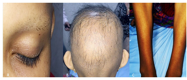
Fig. 1: Clinical features of the 14-year-old girl showing: (A) follicular papules with scaling and hypotrichosis of the eyebrows, (B) erythematous follicular hyperkeratosis over a background of sparse scalp hair, and (C) ichthyotic affection of the forearms

A 14-year-old-girl (Proband) born out of first degree consanguineous marriage presented with complaints of loss of hair and spiny lesions on the scalp and eye brows since childhood. She recalled complete absence of hairs at birth and gradual appearance of sparsely distributed fine hairs over scalp with age. The spiny lesions on scalp and eyebrows were itchy, red and scaly. History of atopy and photophobia were absent. There was no history of similar complaints in the parents, although her brothers were detected to have similar skin lesions (vide infra). The child was stunted for her age. On cutaneous examination there was presence of erythematous hyperkeratotic papules associated with hypotrichosis, with fine, short, brittle hair, affecting the scalp, eyelashes and eyebrows with evidence of cicatricial alopecia at places, and presence of ichthyosis over the limbs [Figure 1]. Keratosis pilaris was noted on the extensor surfaces of the upper and lower extremities. There was no palmoplantar hyperkeratosis. Nails, teeth and genitalia were unremarkable. Trichoscopy revealed follicular keratosis with evidence of cicatricial alopecia, perifollicular scaling, and irregular eyelashes with scaling and erythema at the follicular base [Figure 2]. Two of the four brothers of the proband were also affected.