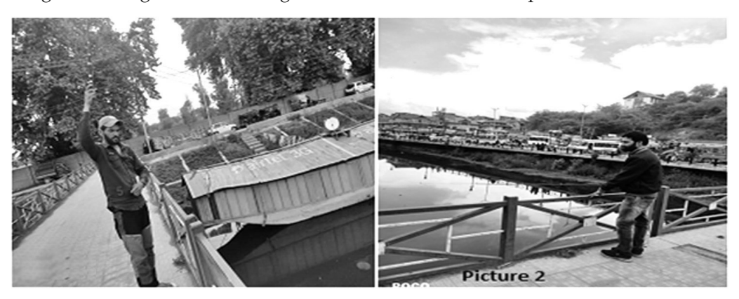
Indian Journal of Waste Management / Volume 5, Number 2 / July-December 2021