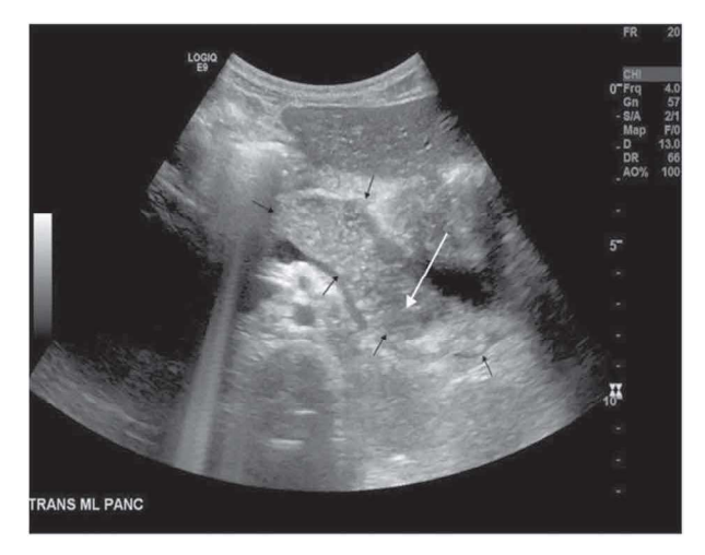
Fig. 1: Usg (at level of pancreas).

old girl who initially complained of 48 hours of abdominal pain and anorexia. She was afebrile, with elevated lipase (676, normal 80-360 U/L) and an abdominal ultrasound and CT suggestive of necrotizing pancreatitis. The lower chest on the abdominal CT showed a normal-sized heart, small bilateral pleural effusions, and clear lung bases. Her pancreatitis was managed with IV fluids, ketorolac, and hydralazine; she was started on ceftriaxone and metronidazole. She improved with supportive care and was discharged on hospital day 4 with a normal lipase. Two weeks later her abdominal pain returned and was associated with reported fever (101°F).