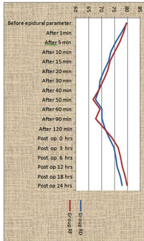
Fig. 3: 12 Intra and post-operative Diastolic blood pressure (mmHg).