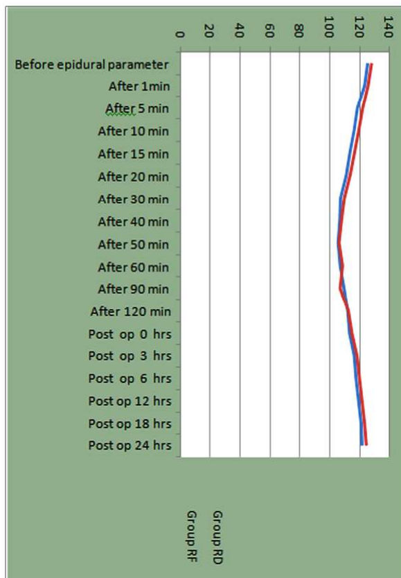
Fig. 2: Intra and post-operative mean Systolic blood pressure (mmHg).