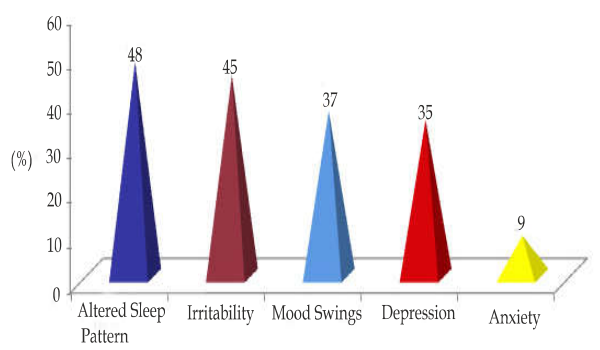
Fig. 2: Incidence of Different Psychological Premenstrual Symptoms.

Among the psychological symptoms, participants faced higher frequency of altered sleep patterns (48%) followed by irritability (45%), mood swings (37%), depression (35%) and anxiety (9%) (Fig. 2). The number of premenstrual psychological symptoms had significant negative correlation (p<0.05) with age at menarche i.e. earlier the age at menarche, more the number of symptoms.