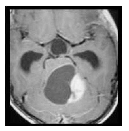
Fig. 2. Axial T<sub>1</sub>-weighted MR image showing a large vermian cyst with a mural nodule

Metastatic spread of ALL and NHL can be seen uncommonly in any part of CNS<sup>9</sup>. Three percent of all cranial metastatic lesions occur in the brainstem and 18% occur in the cerebellum. The site of origin includes breast, lung, skin, and kidney. Solitary metastasis is better treated by surgical removal before radiation therapy.