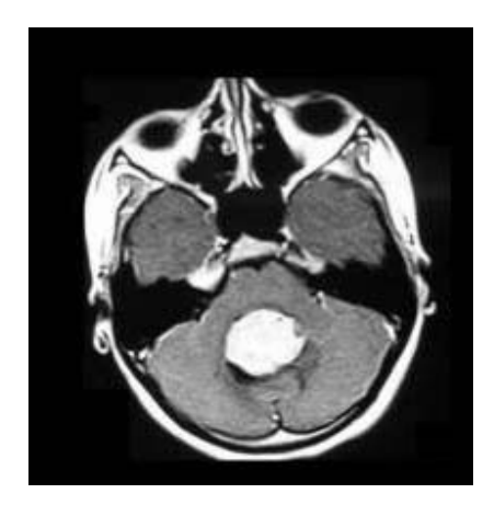
Fig. 1. Axial T_1 -weighted contrast enhanced MR image showing a intensely enhancing medulloblastoma occupying the fourth ventricle

It is a very aggressive embryonic malignancy that occurs predominantly in children younger than 5 years of age and can occur at any location in the neuraxis. The histology demonstrates a heterogeneous pattern of cells including