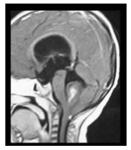
Fig. 3. Sagittal T_1 -weighted contrast enhanced MR image showing an enhancing fourth ventricular ependymoma with inferior extension

rhabdoid cells that express epithelial membrane antigen and neurofilament antigen<sup>97, 98, 99</sup>.