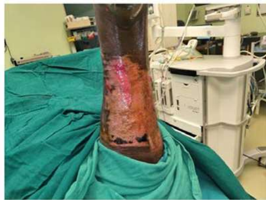
Fig. 1: Raw area which ishealed after application of sucralfate