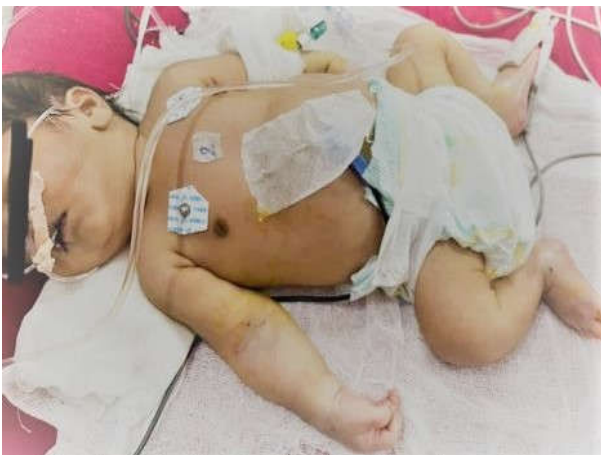
Fig. 1: Dengue Patient Presentation.

Due to clinical suspicion of dengue, serology of the baby was sent which was positive for nonstructural antigen 1 (NS1) and Ig G test. Retrospectively the mother's serological test results were sent and were positive for nonstructural antigen 1 (NS1) and IgM test for dengue and were negative for human immunodeficiency virus, Hepatitis B surface antigen, and venereal disease research laboratory. The baby developed severe respiratory distress. His peripheral pulses were feeble, blood oxygen saturation fluctuated between 80% and 92% on pulse oximetry. He had massive hepatomegaly (liver 4 cm in the right midclavicular line), gross ascites, gross pleural effusion confirmed on USG (gall bladder wall pseudo thickening was noted), decreased air entry in bilateral basal region of the lung. Urine output was decreased. Intensive care was given to the baby with CPAP support, fluid as per dengue protocol, inotropes and blood transfusions. The shock improved gradually in response to treatment with normalizing urine output, blood pressure and decrease in edema. Patient was shifted to nasogastric tube feeds. After stabilization patient was discharged.