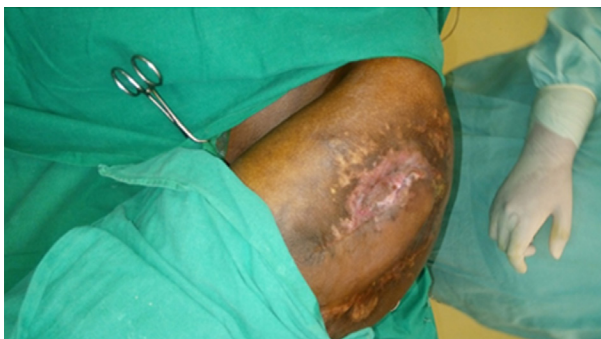
Fig 3: Left trochanter pressure ulcer reconstructed with left tensor fascia lata (TFL) flap after control of pseudomonas infection.

bed preparation (WBP) to reconstruct with skin graft or flap. Pseudomonas is one of the most common & resistant bacteria delaying the process of wound bed preparation (WBP). The growth of pseudomonas is suppressed in an acidic media, vinegar being one of the commonly used topical agents. Few articles are available, mentioning other topical agents like citric acid and ascorbic acid.