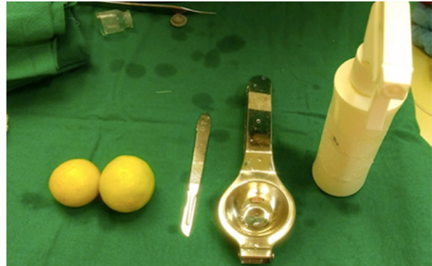
Fig 1: Lemon Juice Therapy (LJT) Set

LJT set includes lemons, knife (to cut the lemon), lemon juice extractor and a container with sprayer (fig. 1). Outer surface of Lemon was wiped with alcohol swab. Lemon juice was extracted by a