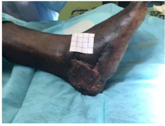
Fig. 3: BJWAT Score 13 after treatment (skin grafting)