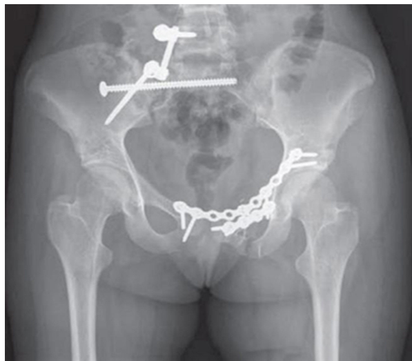
Fig. 2: Show Helical CT of the Abdomen

products, the surgery lasting for a total of 20-22 hours.