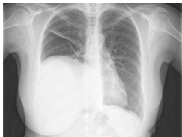
Fig. 1: An emergent chest x-ray

A 26 year old young girl was brought to the emergency department of Max hospital with an alleged history of road traffic accident. The event occurred around 2 hours before arrival to the ER. The patient was initially taken to nearby PHC (Primary health center) where initial treatment was given and referred to higher centers.