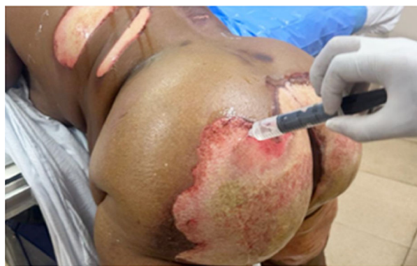
Fig. 2: Showing application of phenytoin solution over the thermal burns

(Fig. 2). Before commencing phenytoin therapy, the surface area of the raw wound was assessed using digital planimetry software, and tissue cultures were obtained. Topical phenytoin was applied every third day until the skin grafting, or resolution of the burn wound. Intravenous phenytoin solution, ranging from 100-300 mg (50mg/1ml), was dispersed over the wound surface and covered with Vaseline gauze dressings. Patient underwent monitoring for wound discharge, pain intensity, granulation tissue formation, and wound contraction every three days. Additional systemic support, such as nutritional supplementation, antibiotics, and analgesics, was administered as deemed necessary for individual patient care.