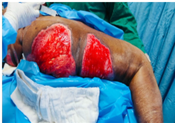
Fig. 3: Shows improvement in the condition of thermal burns three sessions after application of topical phenytoin solution BJWAT Score - 34