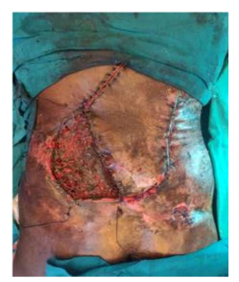
Fig. 6: Post transposition flap