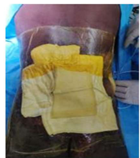
\textbf{Fig. 9:} \ \ \text{Negative pressure wound the rapy for the wound}