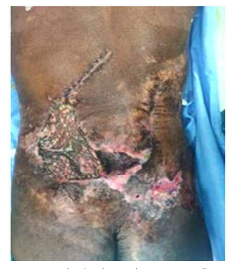
Fig. 7: Necrosis at the distal part of transposition flap