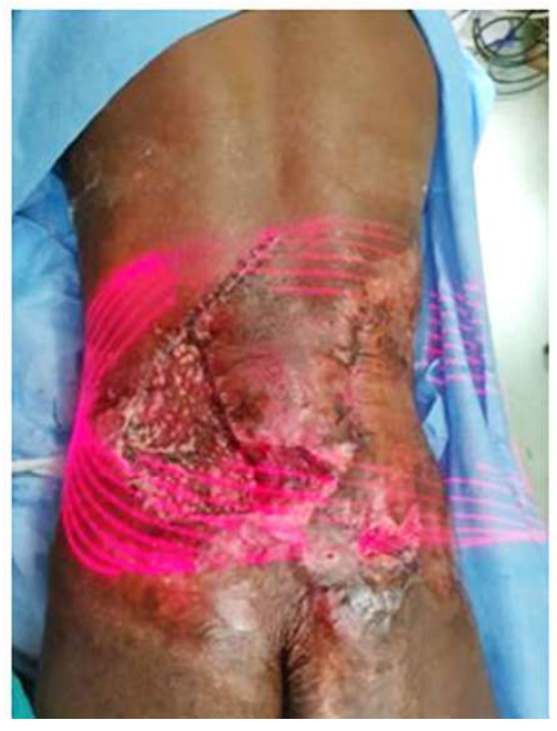
Fig. 12: Low level laser therapy application for wound bed preparation.