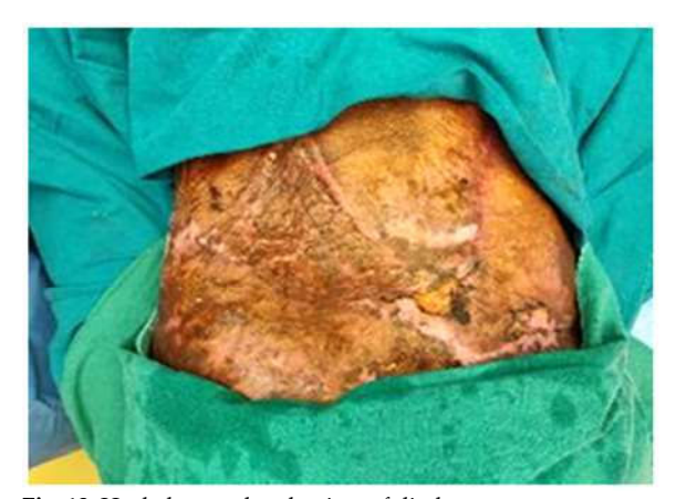
Fig. 13: Healed wound at the time of discharge

The reconstructive ladder was a term coined by plastic and reconstructive surgeons to describe levels of increasingly complex management of soft tissue wounds. Theoretically, the surgeon would utilize the lowest part of the ladder - that is, the simplest reconstruction technique - to address a clinical reconstructive problem. The reconstructive surgeon would move up the ladder as a more complex or suitable method was required for a given reconstruction problem.3,4,5 In this case as the patient is a known case of chronic non healing ulcer post electrical burns with scarring with biopsy came as squamous cell carcinoma. The patient underwent local flap cover based onperforator. A hybrid reconstructive ladder that augments the traditional reconstructive ladder with regenerative medicine modalities. There were improved outcomes at each step on the reconstruction ladder