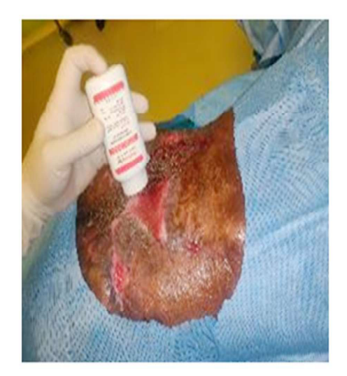
Fig. 11: Centella extract application for wound bed preparation

Indian Journal of Cancer Education and Research / Volume 10 Number 2 / July - December 2022