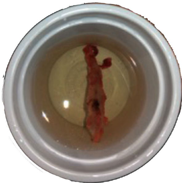
Fig. 1: Shows the excised bony twig of 1 cm in diameter and 5 cm in length

A 45 year-old Syrian male patient was undergoing a reversal of a colonic stoma, which was constructed during an earlier Hartmann's colectomy for a perforated sigmoid cancer. At the time of closing the midline laparotomy incision, the operating surgeon was unable to pass the suture needle through the left limb of the incision's upper angle. He reported a gritty resistance to the needle's tip and felt a hard oblong mass when he palpated the area. The operator decided to explore the lesion by incising the tissues overlying it, which revealed a bony twig of 1cm in diameter and 5 cm in length. The bone had a caudal free rounded end embedded in the left rectus abdominis muscle. The surgeon proceeded to dissect the bone, not knowing its nature, cephalically, where it was found to join the sternum by a fibrous band. The bone was excised (Figure 1)