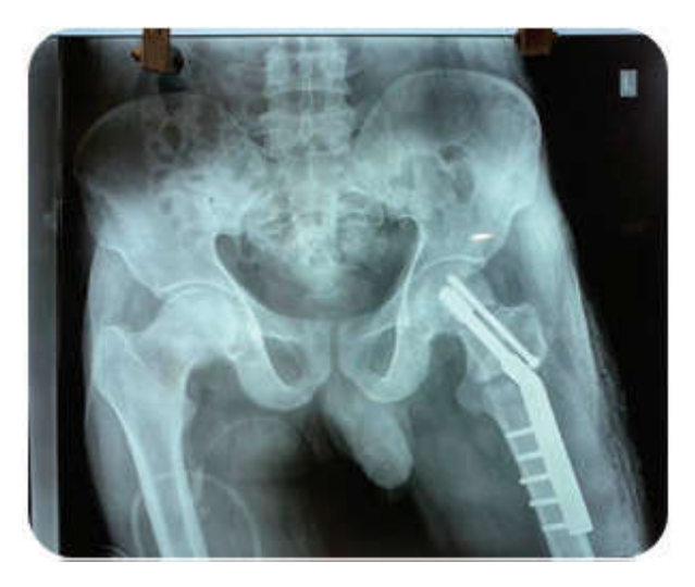
Fig. 2: Post Operative X-Ray : X-ray pelvis with bilateral hips.

4. The head of the femur is viable suggestive of Sandhu stage 2 classification.(Fig. 1)