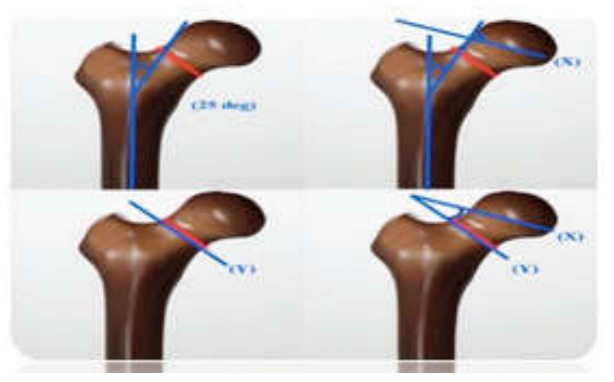
Fig. 3: Preoperative blood investigations.