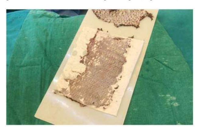
Fig. 2: Collagen sheet placed over SSG

In our case we did a split skin grafting by combining dry collagen sheet with the split skin graft harvested from his right thigh (Fig. 2 & 3).