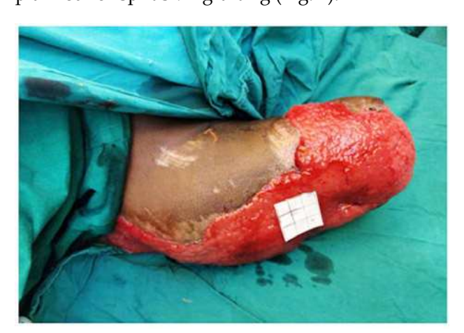
Fig. 1: Post traumatic raw area right upper limb amputated stump wound bed

This study was conducted in the Department of Plastic surgery in a Tertiary care centre in South India. Departmental ethical clearance and consent from the subject were obtained. This is a non-randomised case study. The details of the patient in study are as follows: 22-year-old male with alleged history of crush injury right upper limb while working with cement mixer and underwent guillotine amputation at the level of mid arm followed by he developed post traumatic raw area in the upper limb stump. The wound bed preparation was done with autologous platelet rich plasma, low level laser therapy and scaffold dressing. Once wound bed prepared well, we planned for split skin grafting (Fig. 1).