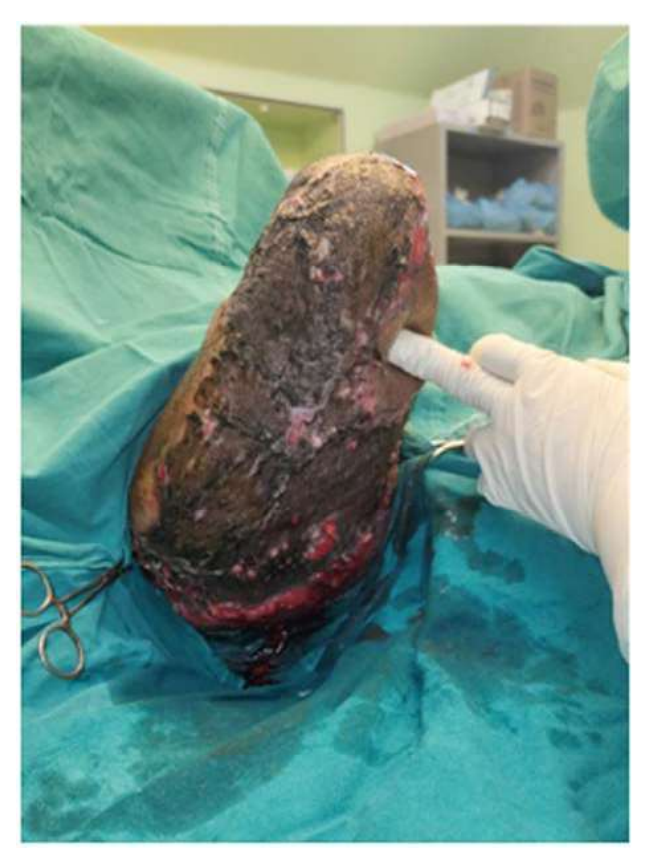
Fig. 5: Post-operative day 10

Dermal matrix assisted skin graft was well taken on day 10 (Fig. 5). No graft loss noted with this procedure. No complication observed in the patient. Patient discharged successfully.