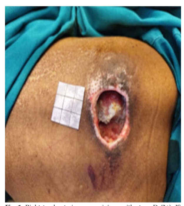
Fig. 1: Right trochantericpressure injury with stage D (3+); IS (3+); PS (0); RC (4) at admission

The Kumar classification for pressure injury reduced from stage D (3+); IS (3+); PS (0); RC (4) to stage D (3); IS (2+); PS (2); RC (4) after 3 weeks of the treatment allowing us to know the progress and response to the treatment (fig. 2). The treatment is still going on till the reporting of this study. We found Kumar classification for pressure injury useful not only documenting the findings at the time of admission but also to know the response to the treatment.