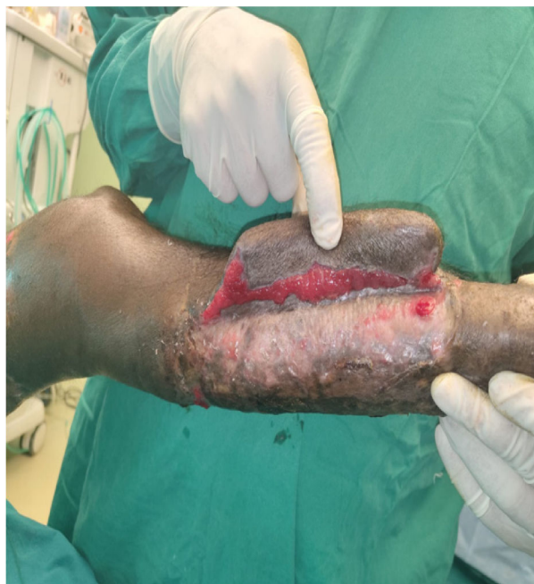
Fig. 3: Healed raw area after 3 weeks of using feracrylum 1%

In this study, we had a patient with donor site raw area wound overlying aon limb from which cross leg flap was raised. The wound at the end of 3 weeks showed a significant reduction in the treated area measured by digital planimetry with a new epithelium development (fig. 3). After treatment, the size of the raw area surface decreased. Due to the application of feracrylum, no additional pain occurred. Minimal soaking of the wound with good hemostasis and eradication of infection was observed.