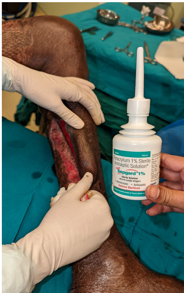
Fig. 2: Application of feracrylum 1% solution

As pilot research, the investigation was carried out in a higher education facility in August 2023. The research was entirely descriptive; no statistical analysis was carried out. After gaining informed consent, the patient with the donor site raw area was included. The patient was 57 years old and admitted for raw area overlying a fracture site with bone loss. For which a cross leg flap was raised on opposite leg. But the donor raw area (fig. 1) of flap was not healing. Adjuncts such as skin grafting platelet rich plasma, low level laser therapy were