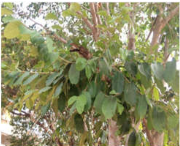
Plate-3: Habit of Holoptelea integrifolia.

The seeds of Holopteleaintegrifolia were collected for the present study Holoptelea integrifolia, Planch.selected in Nirmala College campus to find out the qualitative phytochemical and minerals analysis of the seeds of Holoptelea integrifolia wereanalysed. Seeds were collected during the month of April. The data were then processed and represented in tables and chart.