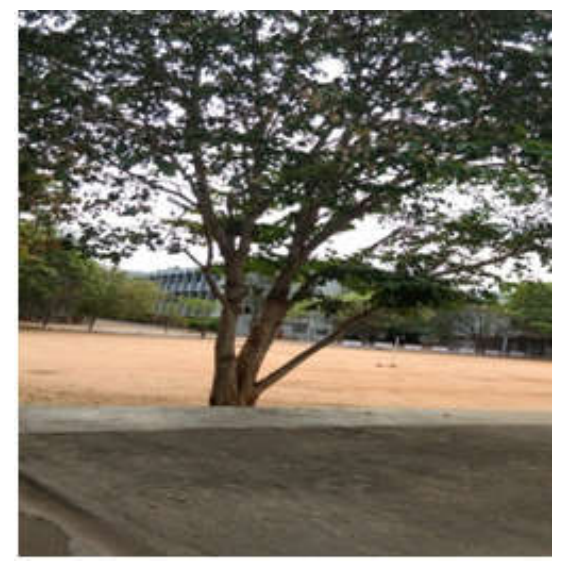
Plate-2: Study Area.

Plate-1: Location Map.