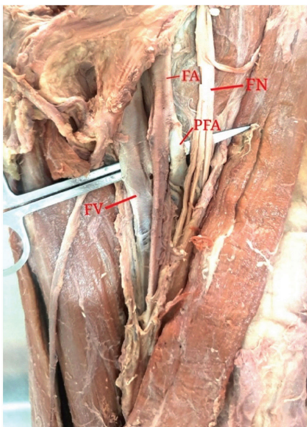
Fig. 3: PFA originating from posterolateral aspect of FA.