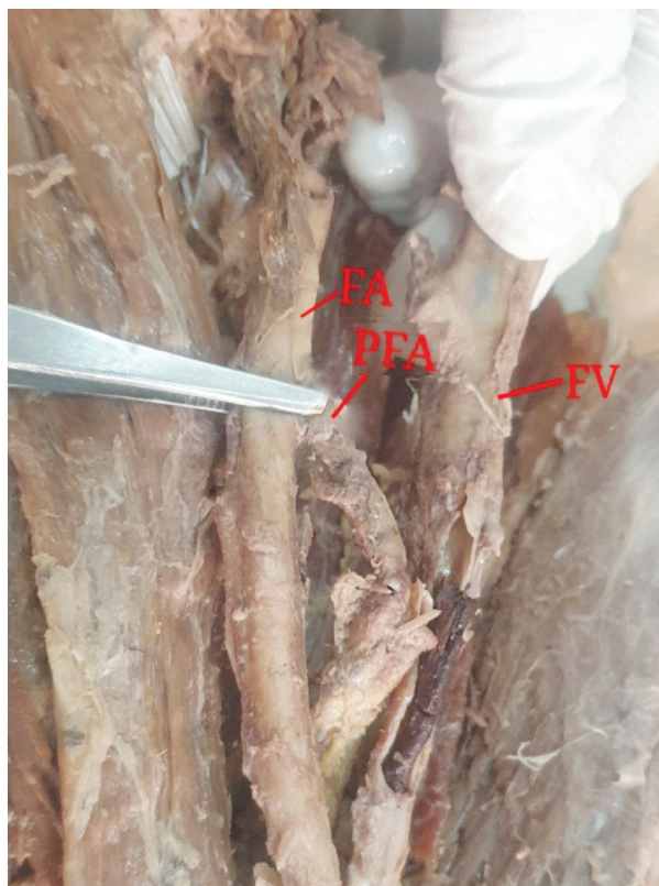
Fig. 4: PFA originating from medial aspect of FA.