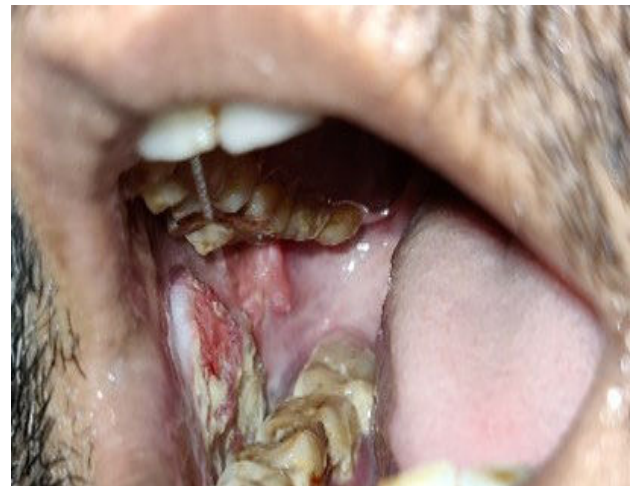
Fig. 2: Case of OSMF with OSCC