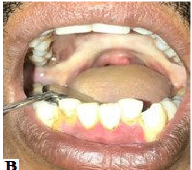
Fig. 1A: Case of OSMF with reduced mouth opening and blanched buccal mucosa, Fig. 1B: Case of OSMF showing hockey stick shaped uvula

Inflammation is considered as the 7 th hallmark of cancer. Recent studies have unfolded the molecular pathways involving cancer and inflammation. With evolution in the field of biomarkers, use of