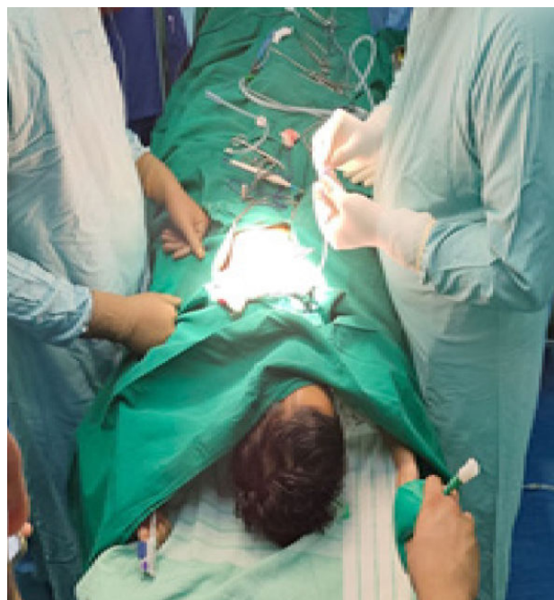
Fig. 1: Intraoperative Gastrostomy

The child was premedicated with Inj. Glycopyrrolate, Inj. Midazolam and Inj. Fentanyl and pre-oxygenation with 100 percent oxygen. The patient was intubated with a 4 mm uncuffed