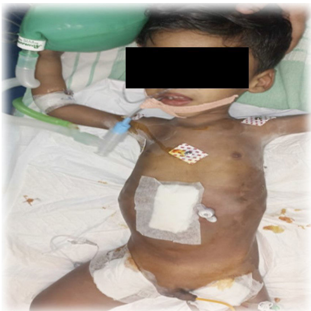
Fig. 3: Post Operative ICU

sevoflurane and maintained with a combination of nitrous oxide and oxygen. Skeletal muscle relaxation atracurium was given. The pediatric surgeon performed a gastrostomy by identifying