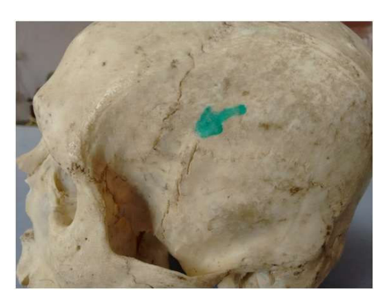
Fig. 2: Sphenoparital type of pterion.