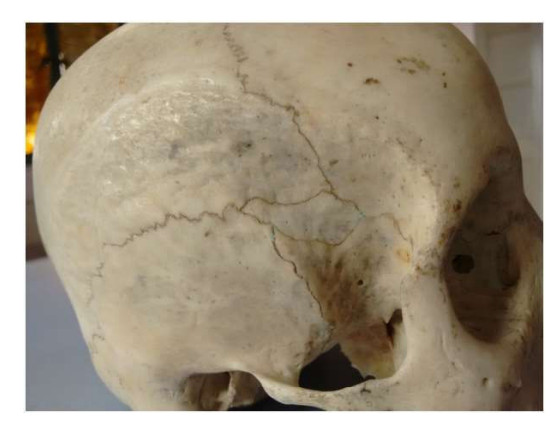
Fig. 4: Epipteric type pterion.

In present study, 56 skull having 112 sides 78 were sphenoparital, 26 epipteric type, 5 stellate type and 3 of frontotemporal type.