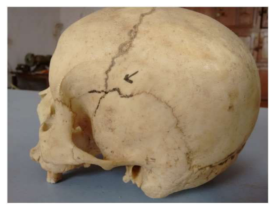
Fig. 1: Stellate type of pterion.