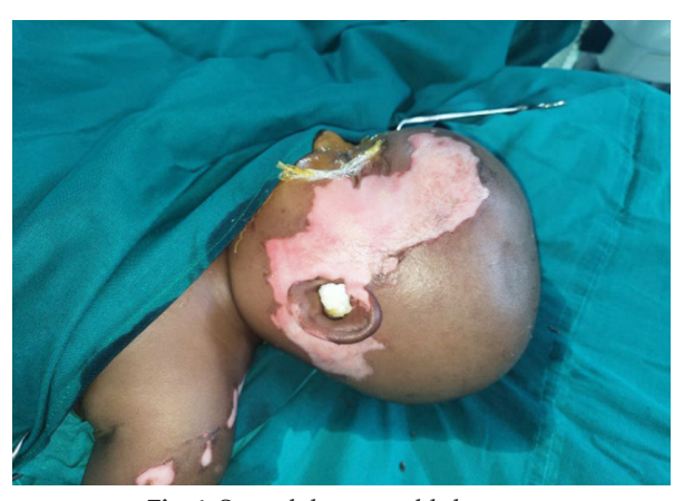
Fig. 1: Second degree scalds burn

This study was conducted in Tertiary Care Centre in Department of Plastic Surgery after getting the department ethical committee approval. Informed consent was obtained. The subject was a 18-month - old female child who had accidental second degree scald burn injury which involves her left upper limb, left side of her face and postauricular region. She was admitted in tertiary burn care unit