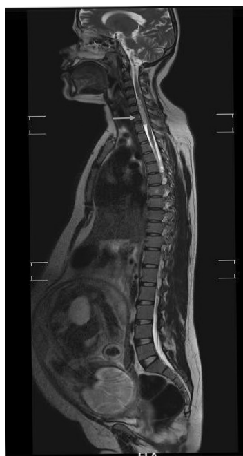
Fig. 1: MRI showing a well-defined intradural extramedullary lesion in the spinal canal, C5-D1 level compressing the spinal cord with T2 hyperintensity likely schwannoma

An MRI of the abdomen, pelvis, uterus, and fetus without contrast was performed, which revealed a well-defined intradural extramedullary lesion in the spinal canal, C5-D1 level compressing the spinal cord with T2 hyperintensity suggestive of a nerve sheath tumour likely schwannoma.