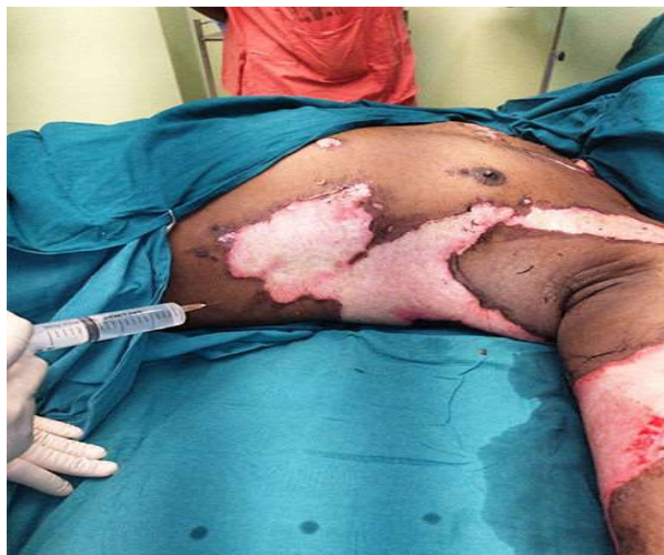
Fig. 1: Wound with BJWAT Score 32 at admission