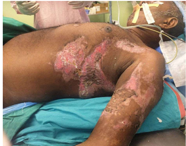
Fig. 2: BJWAT Score 15 after treatment and skin grafting