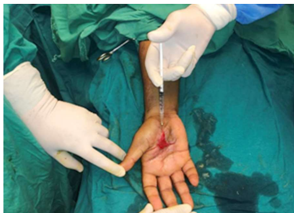
Fig. 8: Wound bed before grafting

sensitivity. Following this the wound showed good granulation and contraction (Fig. 8). The patient was planned for split skin grafting following a sterile culture. Split skin grafting was done over the raw area and satisfactory graft take was noted (Fig. 9). Patient was discharged and donor site healed well.