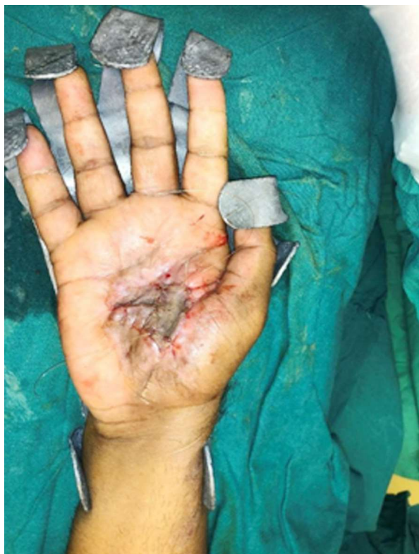
Fig. 9: Skin grafting done