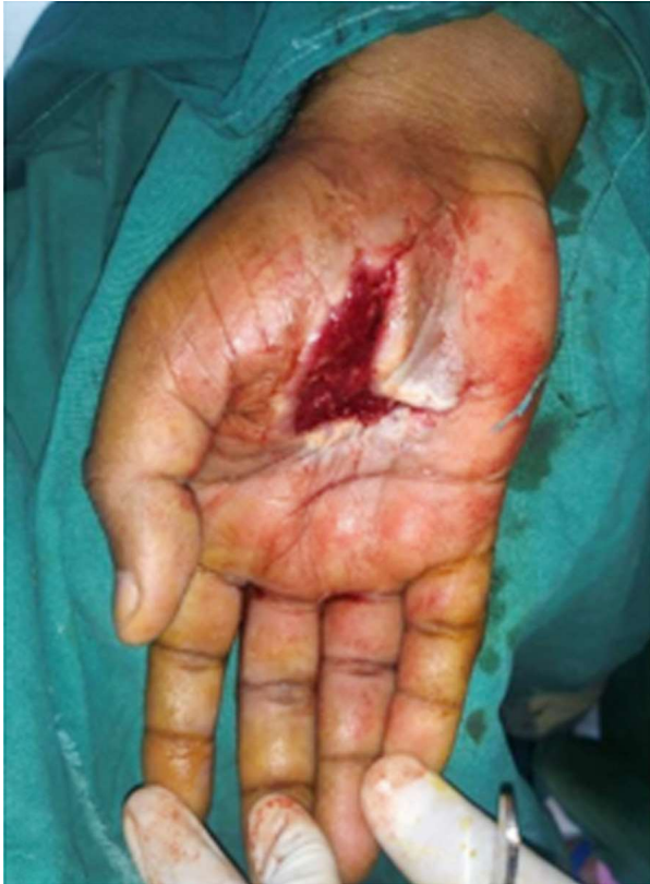
Fig. 3: Wound after debridement