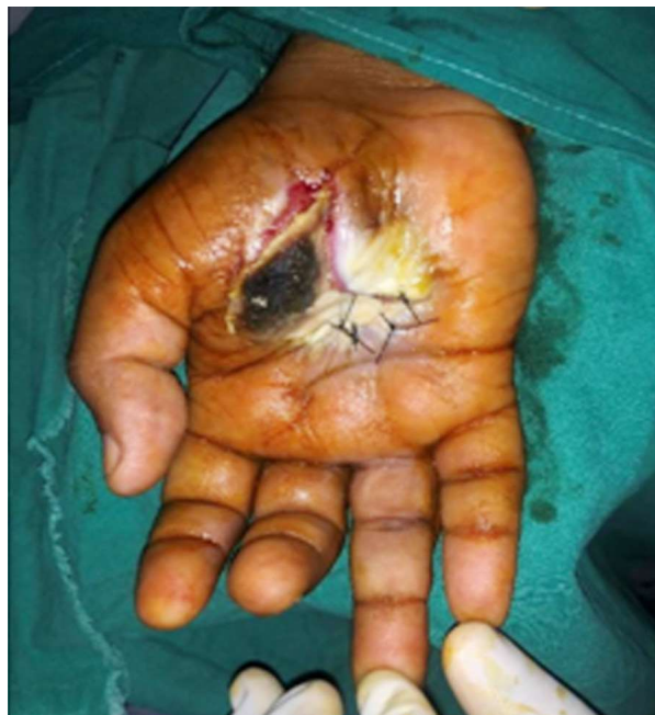
Fig. 2: Wound at presentation

Imaging of right hand was done suggesting no features of osteomyelitis. Patient was treated with appropriate antibiotics as per culture and