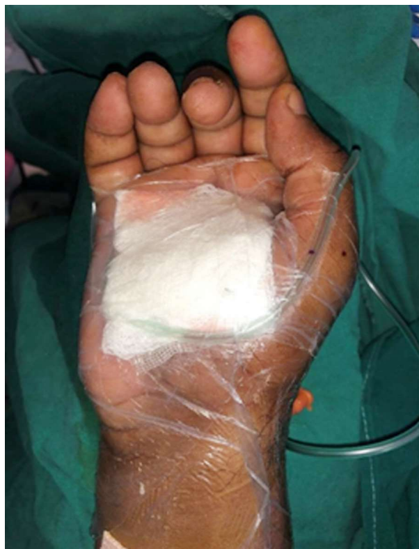
Fig. 7: Negative pressure wound therapy