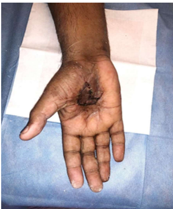
Fig. 10: Day 7 post skin graft

and good graft take was noted (Fig. 10). Patient was successfully discharged. Application of this systematic approach not only improved wound healing and reconstruction process, but also ensured good compliance from the patient.