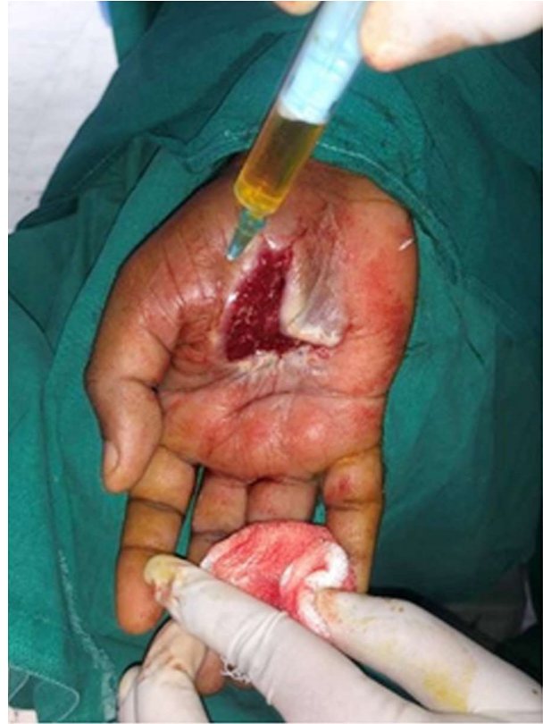
Fig. 4: APRP therapy