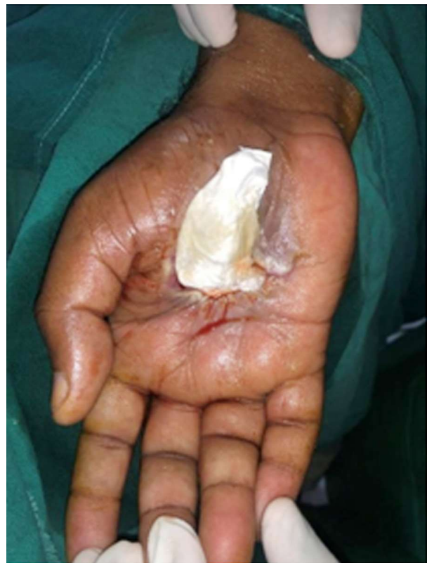
Fig. 6: Vitamin D and sucralfate dressing with collagen scaffold