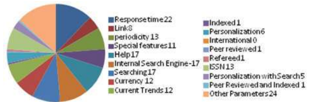
Fig. 1: Distribution of E-Newsletters by Parameter Coverage.

The table and chart shows that out of 24 E-Newsletters Good Response time 22 (90%), Help, Internal Search Engine, Searching 17 (70%), Periodicity 13 (54%), Currency and current trends 12 (50%), Link 8 (33%), Personalized 6 (25%), Search with Personalization 5 (20%), Refereed, Indexed, Peer Reviewed, Peer Reviewed and Indexed having 1 (4%). Rest Parameters have 24 (100%)