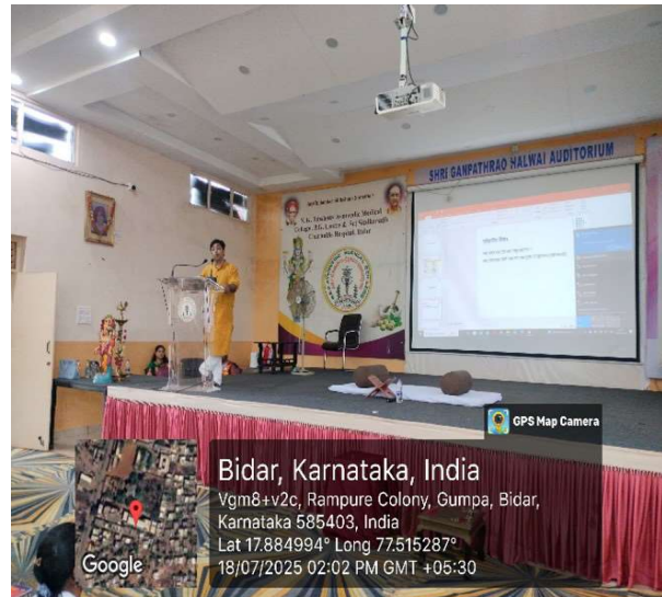
Bidar, Karnataka, India Vgm8+v2c, Rampure Colony, Gumpa, Bidar, Karnataka 585403, India Lat 17.884994° Long 77.515287° 18/07/2025 02:02 PM GMT +05:30