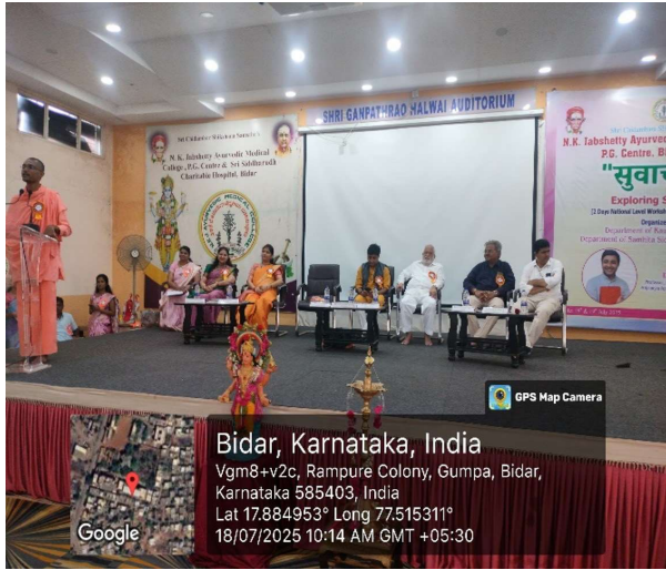
Bidar, Karnataka, India Vgm8+v2c, Rampure Colony, Gumpa, Bidar, Karnataka 585403, India Lat 17.884953° Long 77.515311° 18/07/2025 10:14 AM GMT +05:30