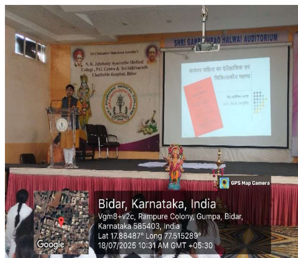
Bidar, Karnataka, India Vgm8+v2c, Rampure Colony, Gumpa, Bidar, Karnataka 585403, India Lat 17.88487° Long 77.515289° 18/07/2025 10:31 AM GMT +05:30