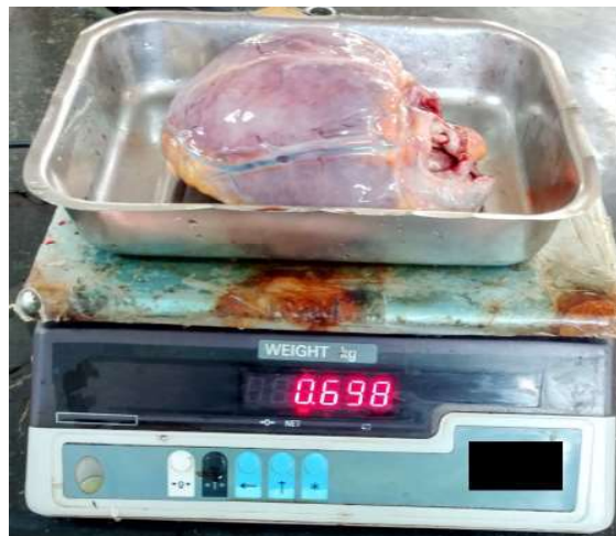
Fig. 1: Enlarged heart weighing 698 g.

On autopsy, externally, no specific findings were present. Internal examination, however, revealed that the heart was enlarged and weighed 698g (Fig. 1) with a circumference of 36 cm. The left ventricular wall was hypertrophied, and the thickness was 3 cm. The right ventricular wall was 2.8 cm thick and was also hypertrophied. The apex was rounded, with the mitral valve measuring 12 cm and the tricuspid valve measuring 9 cm.